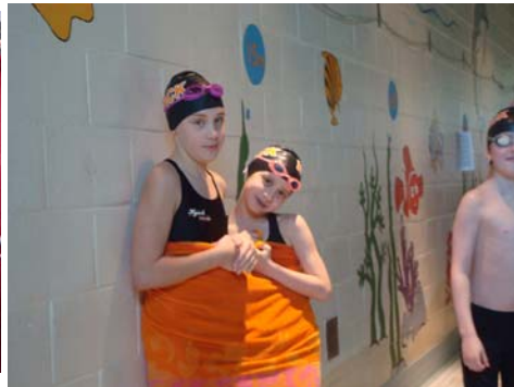
Girls staying warm, nice towel color...!