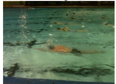
5:30 AM, Hyack Youth kids lending a hand long course...