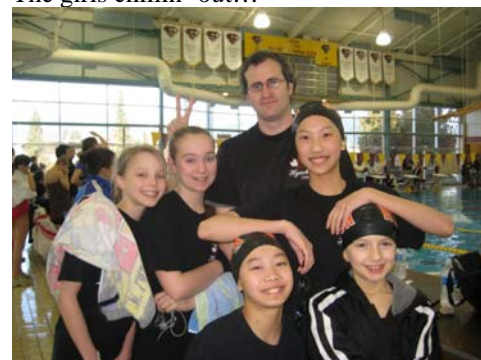
Getting psyched for relays...