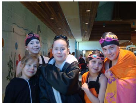
It's relay time, always fun for Hyack!