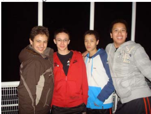
Gents on the ferry.