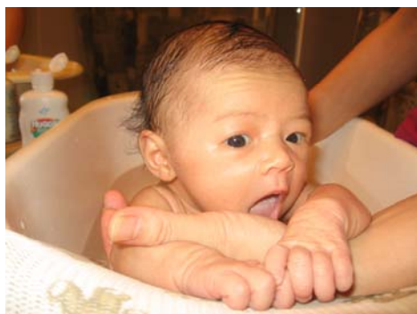
...learning how to streamline...