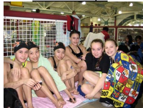
The girls chillin' out...