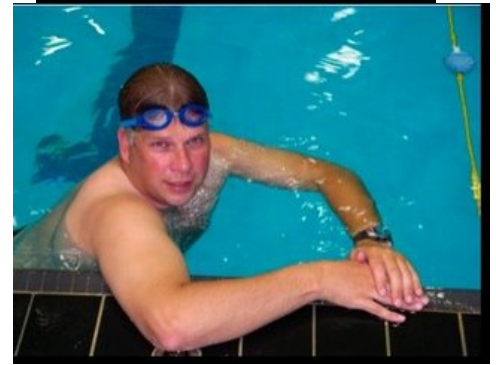
Ready to tackle the challenge! Swimathon not such a big deal, eh kids!