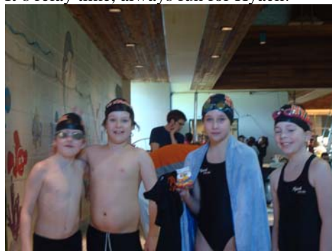
LMR vets on the right, rookie gents on the left...