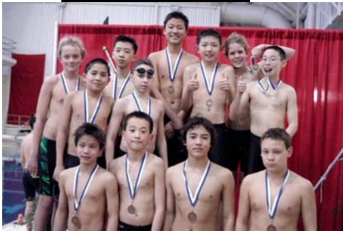
Boys team relay silver...