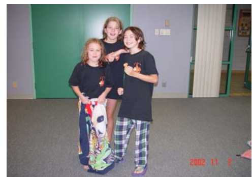
Retro pick.....who's in the middle...?